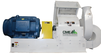
MILL- HMA 125