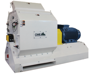
MILL- HMX 400